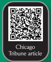
Chicago Tribune article