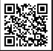
FP&F Transporting Kiva profile